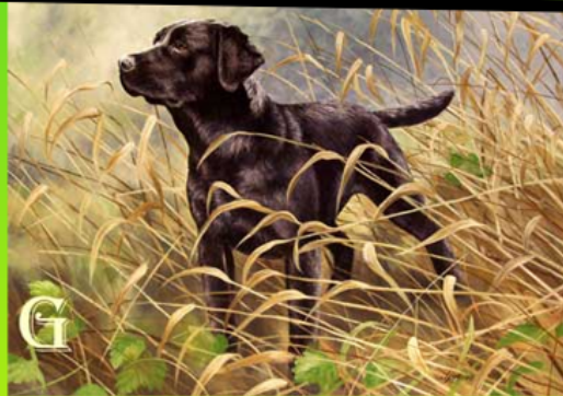
THE MUSCLE FLUFFY